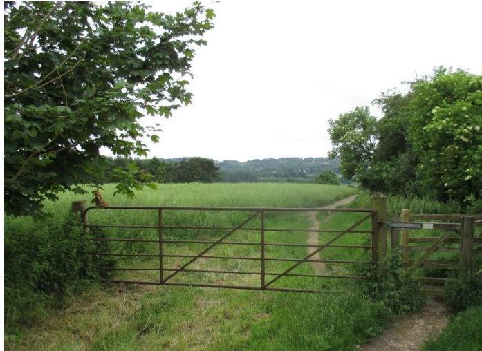
Cannock Chase from lane to Walton Farm