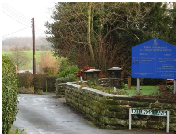
View across Penk Valley from Kitlings Lane