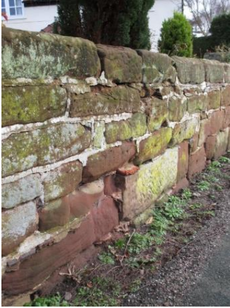
Failure of pointing