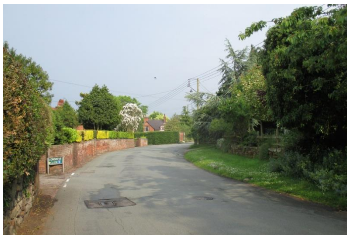
Unkerbed roadside, grass verges, hedges and boundary walls