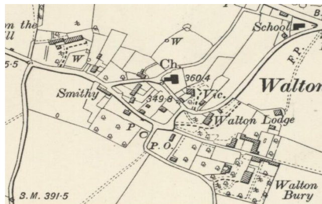
OS Map 1902