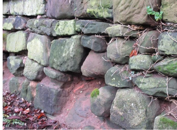
Erosion of stonework and mortar