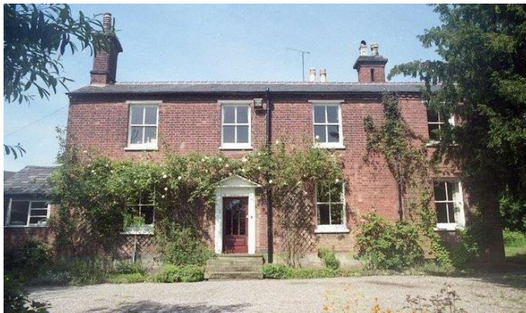
The Old Vicarage before recent alterations