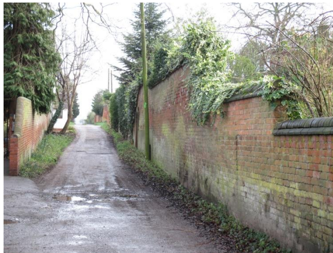
The lane to Walton Farm