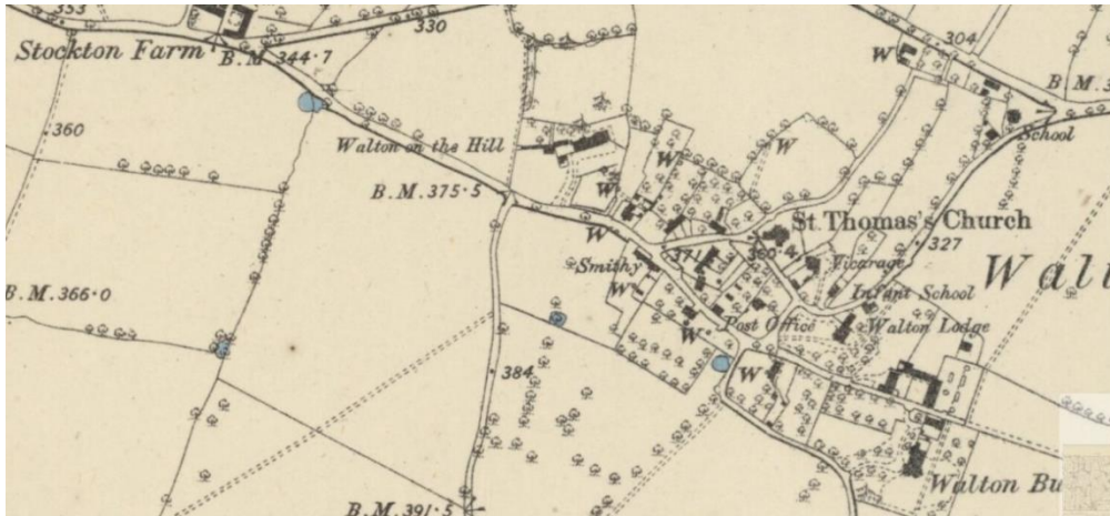
First edition OS map 1886