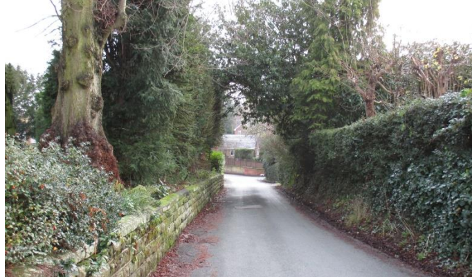
Stone walls and hedges by the church

gardens. The road edges are defined by brick and stone walls. The tall retaining walls to the former Walton Lodge and the counterpoint of the hedges around the Old School and the Old Vicarage give particular emphasis to the approach along School Lane. The few houses in this part of the village are well hidden by the density of tree and hedge cover.